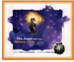
The Angel with the Golden Glow: A Family's Journey Through Loss and Healing