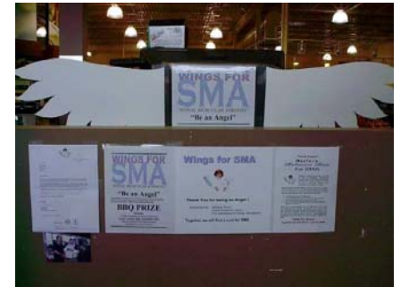
Sample Window Display

If you are interested in getting a 'donation at